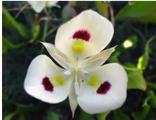
Segoe Lily ( Calochortus nuttallii ).