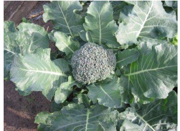
"Broccoli plant" by Rasbak - Own work. Licensed under CC BY-SA 3.0 via Wikimedia Commons – https://commons.wikimedia.org/wiki/File:Broccoli_plant.jpg#/media/File:Broccoli_plant.jpg