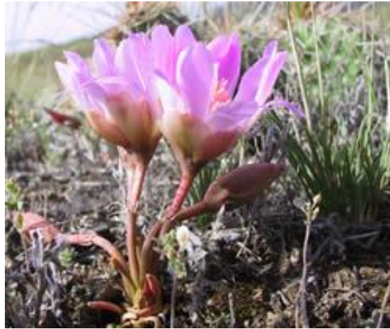
Lewis' bitterroot ( Lewisia rediviva ).

Many native North American tap-rooted plants have served as a main staple for existence. Native Americans from the western portions of North America used one such species, Lewis' bitterroot. Roots were often collected and dried for winter use. Roots were then boiled and used as a food source when other food sources were scarce. Roots were also used for medicinal purposes including sore throat aid, poison ivy rashes, and heart pain.